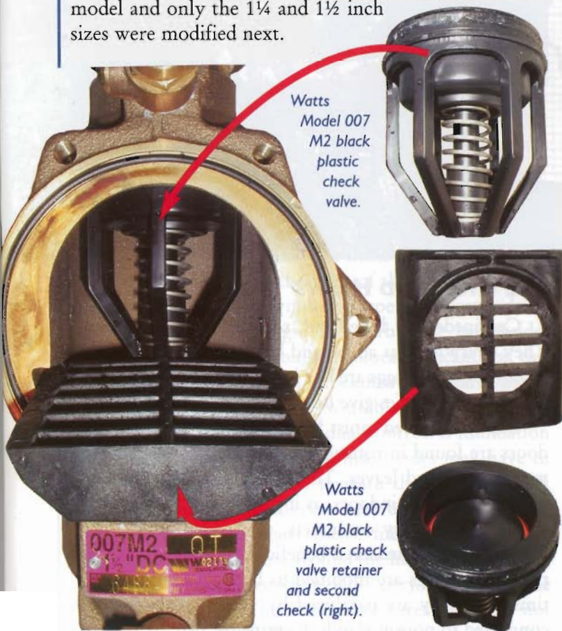
Watts Model 007 M2 black plastic check valve.

This modification has a black plastic check valve retainer, as opposed to the stainless steel retainer in the other two models. The 007 M2 check valve modules and disc holders are completely black plastic.