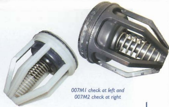
007M1 check at left and 007M2 check at right

Let's start with the original 007 that was produced in the 1 1/2 and 2 inch sizes. This model is distinguishable