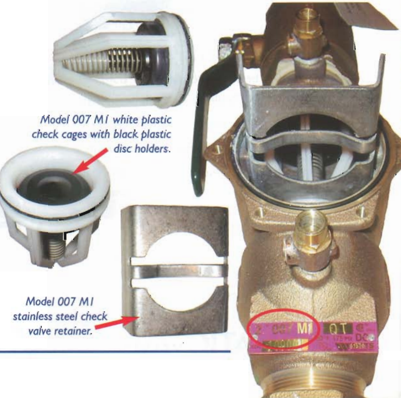
Model 007 M1 white plastic check cages with black plastic disc holders.